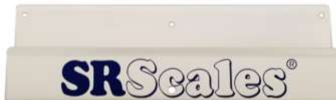
Figure 1: Wall Bracket