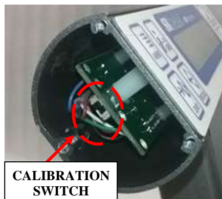
Figure 6: Calibration Switch Diagram

STEP 2: Put the scale system into Calibration Mode by switching the calibration switch on the display board (Figure 6), "CALIBRATION" will flash on the display.