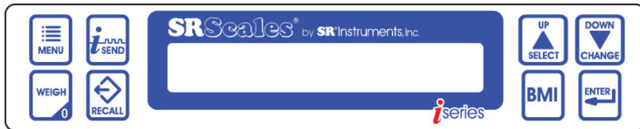
Figure 4: Button Display