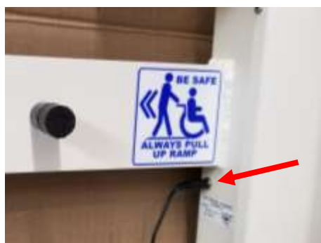
Figure 3: Power Cord Plug In

STEP 9: Carefully lower the SR7001i Series platform down into position for use. Connect the AC power plug into the power supply jack located in the right column support (Figure 3). Plug the power into a wall outlet.