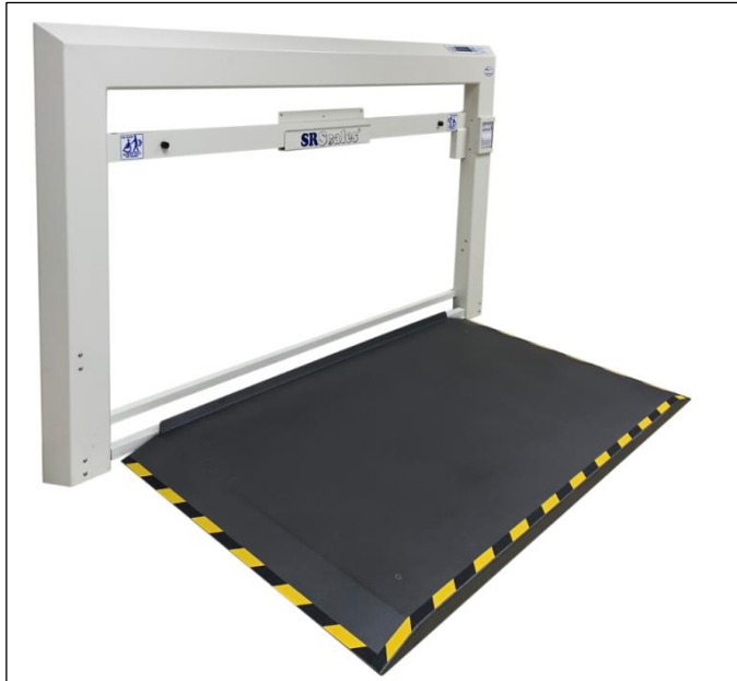
SR Scales' SR7020i Extra Large Stretcher Wall Mount Scale

About fifteen years ago, a new type of innovative, large platform weighing system was introduced to the medical community. The first few models were designed and engineered for weighing wheelchairs and stretchers.