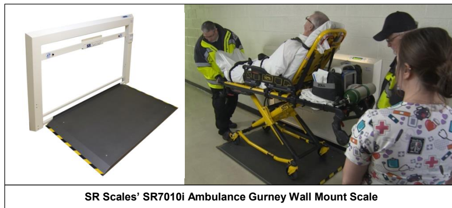
SR Scales' SR7010i Ambulance Gurney Wall Mount Scale

Ambulance Gurney Scale directly in their emergency department entry ways. These scales allow ambulance crews to quickly obtain a patient's weight as soon as they get off the ambulance. Then after the patient has been transferred for treatment, the ambulance crew can weigh their equipment (less patient) to give the tare weight to attending personnel. A built-in printer option on the ambulance gurney wall mount scale can easily provide written documentation for the crews to hand to the hospital staff for patient weight data entry.