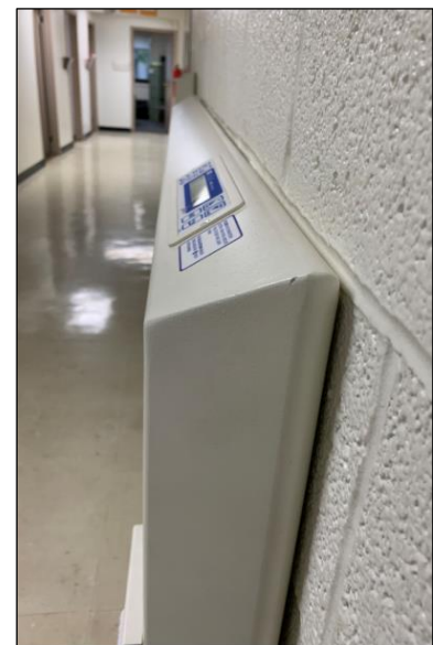
Side view of SR Scales' Wall Mount Scale, width of 3.25"

Larger wall mount scales for weighing patients on stretchers provide hospitals with an attractive and functional alternative to bulky sling or lift scales. The wall mount scale's narrow