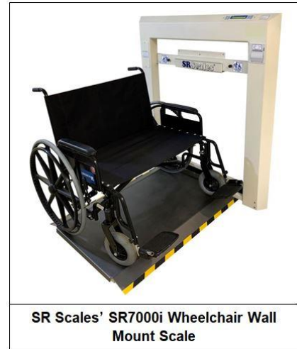
SR Scales' SR7000i Wheelchair Wall Mount Scale